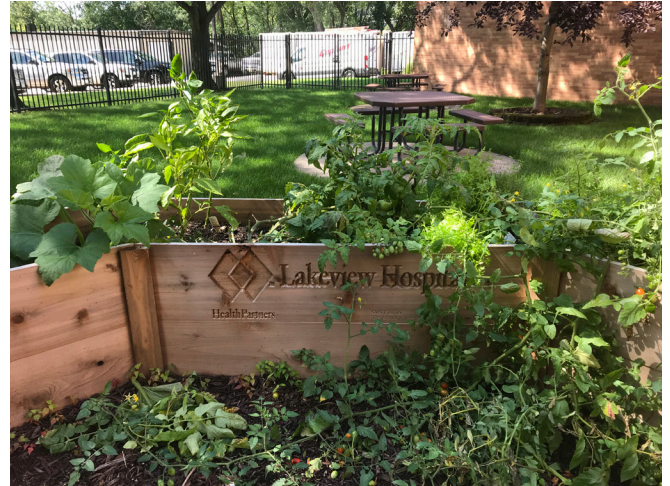
Herb and produce garden at Lakeview Hospital in Stillwater, MN.

Fresh locally grown produce is on the menu for patients, visitors and team members across our organization. Many of our locations also organize weekly farmers markets and serve as drop-off spots for Community Supported Agriculture (CSA) farm shares from June through October. We also have community gardens at HealthPartners hospitals in Wisconsin (Hudson Hospital & Clinic, Amery Hospital & Clinic and Westfields Hospital & Clinic). These are just some of the ways that we are working to increase access to fresh, nutritious (and delicious!) food for our colleagues, patients and the communities we serve. Buying local, not only supports our local economy, but is also better for our environment. Distributing food grown outside our region can add five to 17 times more greenhouse gases than foods that's produced locally.*